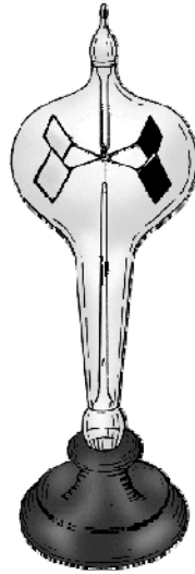
Figure 1.1 Classic vane radiometer, commonly called the Crooke radiometer. 1 [Reprinted by permission from Webster's Third New International® Dictionary, Unabridged ©1993 by Merriam-Webster, Incorporated ( www.Merriam-Webster.com )].

The optical radiation spectrum will be treated in this text, including the ultraviolet, visible, and infrared regions. The visible portion of the optical spectrum covers a rather narrow band of wavelengths between 380 nm and 760 nm; the radiation between these limits, perceivable by the unaided normal human eye, is termed “light.” Measurements within this region may be called “photometric” if the instruments used incorporate the response of the eye. The short wavelength (ultraviolet) limit of radiometric coverage is about 200 nm, approximately the shortest wavelength that our atmosphere will transmit. The longest wavelength (infrared) treated in this book is about 100 \mu\text{m} . This wavelength range includes 99% of the energy (95% of the photons) from a thermal radiator at 0° C (273.16 K).