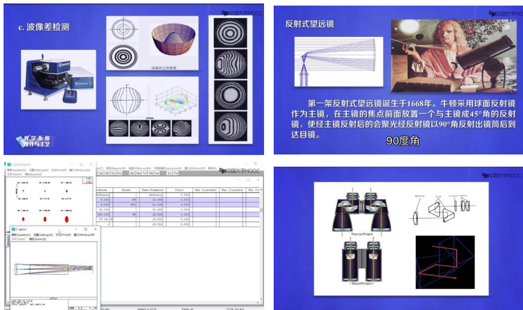
Figure 1. Picture of MOOC of Optical System Design

In 2016, we began to establish the online teaching resources for Optical system design course. We made a massive open online course(MOOC). Considering different demand from different learners, we put the necessary but brief topics of optical system design in the online course, including both theories and practical design methods. Each content in the topics is an independent video about 15-30 minutes. Figure 1 shows some pictures from the videos.