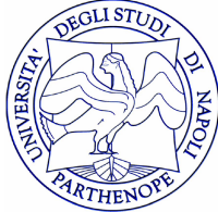
Università degli Studi di Napoli Parthenope