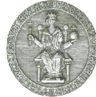
Università degli Studi di Napoli Federico II