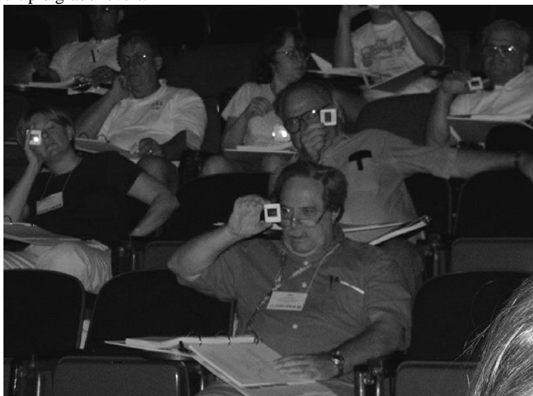
Figure 4 - PHOTON teacher participants observe light spectra through diffraction gratings during an introductory lecture

The second day of each workshop was for teachers/faculty only and was devoted to laboratory explorations and a technical introduction to optics and laser physics. The presentation began with a discussion of laser safety, and was followed by a curriculum overview of optics and laser principles. Participants performed hands-on activities with homemade ray boxes and gelatin-optics and used laser pointers to measure the thickness of a hair. Participants received Optical Society of America (OSA) Optics Discovery Kits, laser pointers and focusing flashlights. Using these materials, PHOTON instructors demonstrated several experiments for multiple grade levels.