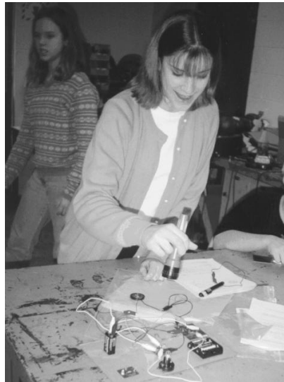
Figure 3 - Middle school student uses a flashlight and photo sensor in a ComTech activity

In the final unit of the module, students construct a system that includes the use of a fiber optic cable as the medium that transmits the light to the receiver. The light is also converted to sound using a conversion circuit and a small microphone and speaker. This final unit makes a complete fiber optic communication system: the student can speak into the microphone, sound is converted into an electric signal, then converted into a light signal that is sent down the optical fiber. The fiber leads to a receiver where the photo sensor converts light into an electric signal which is then converted into a sound wave and transmitted over a speaker.