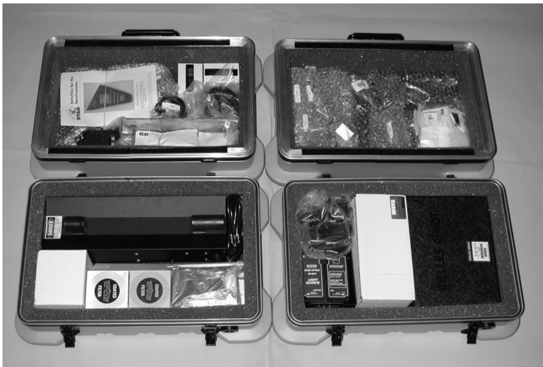
Figure 5 - The PHOTON kit

The PHOTON team made the decision to include components and component mounts of high quality, the type one might encounter in a research lab or in industry, rather than the more commonly encountered aluminum or plastic educational materials. Not only is the equipment more versatile than the "educational" variety, it is similar to equipment students will see on industry field trips, making the school laboratory experience more relevant to the world of work. The PHOTON instructors also provided advice on less expensive ways to outfit an entire classroom laboratory for schools unable (or not wanting) to replicate this particular kit. The contents of the PHOTON kit are listed in Table 3 and the kit itself is shown in Figure 5.