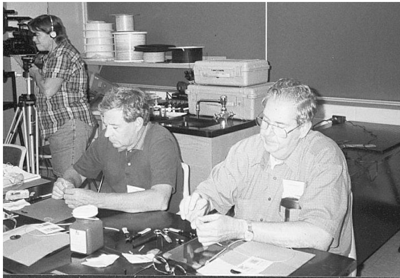
Figure 2 - Teachers practice terminating optical fiber at NCTT workshop